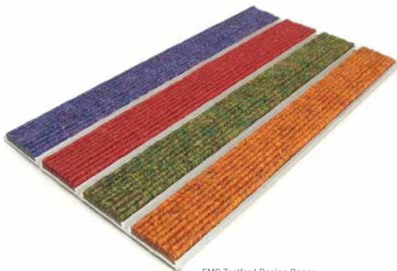
EMS Tretford Design Range

EMS entrance matting comprises of a 100% recycled solid >