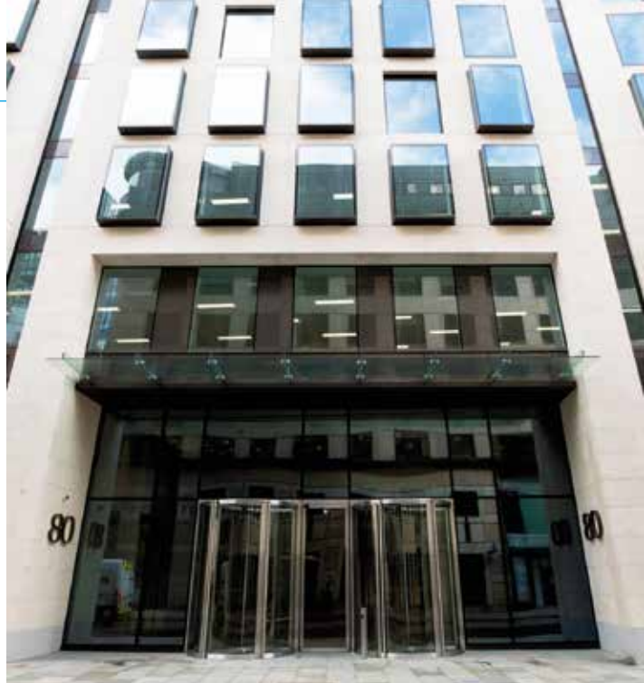
INTRAsystems says it wants to make entrance matting more accessible

By contrast, INTRAsystems matting products are intelligently engineered to respond adaptively, enabling better movement of heavy loads. Sections will undulate flexibly under pressure allowing weight to be transferred smoothly across, however well