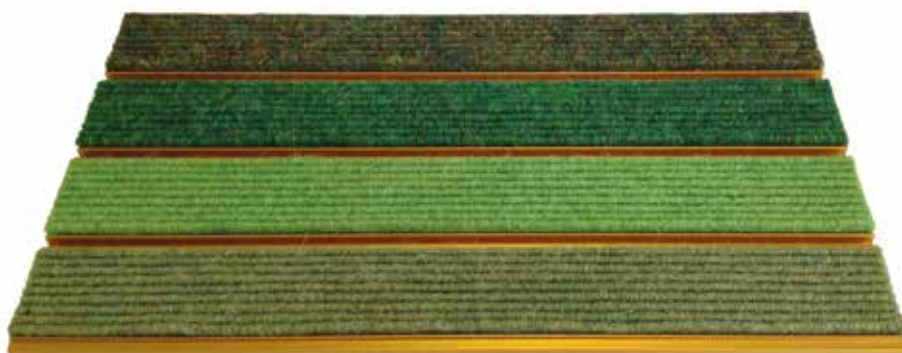
EMS Tretford Design Range - Dark gold anodising

Colour and design has always been at the forefront of EMS Ltd, the first